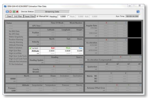
Figure 4: Estimation Filter Data window