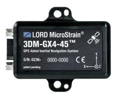
Figure 1: 3DM-GX4-45™ module